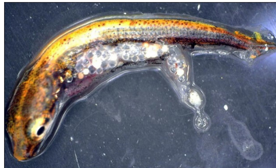
Figure 2: Plastic nanoparticles accumulated in pelagic fish used for fish meal in this way are plastic nanoparticles entering our food chain.

"food" for human consumption. This fish meal is usually made from cheap pelagic fish such as herring and anchovy fish (Figure 2).